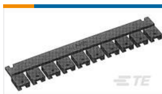
TE Part # 531230-1 SHUNT, .200 C/L, LP, 2 POS, SN